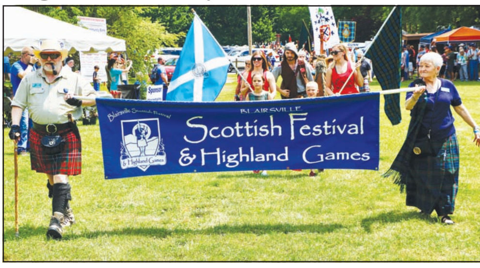
The 2019 Blairsville Scottish Festival & Highland Games will take place this weekend on Saturday, June 8, and Sunday, June 9, at Meeks Park.