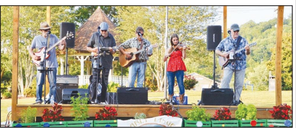
Gnarly Fingers performed in Hiawassee on June 1 as part of the "Enchanted Music on the Square" concert series.